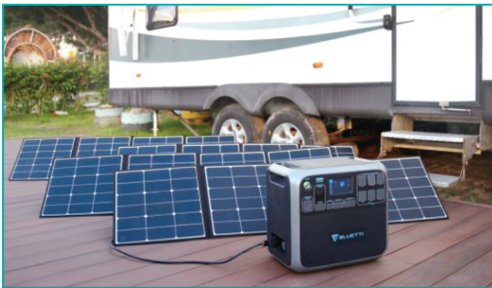
Connect to solar panels to provide reliable power during emergency or prolonged power outages. 700W / 35-150V solar input.